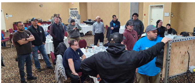
Quarterly operators workshop.

» Operator training: As part of our commitment to building Indigenous capacity in communities, our operators gathered for a quarterly operators' workshop in February. In March, the team members met again in preparation of their Level 1 Water Treatment exams this March. We are all rooting for you, team!